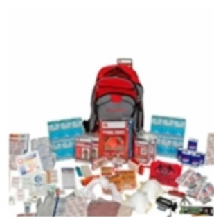
2 Person Deluxe Survival Kit Price: $99.95