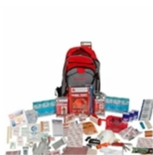
1 Person Deluxe Survival Kit Price: $78.95