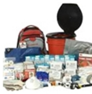
10 Person QuakeDog Deluxe Office Survival Kit Price: $219.95