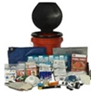
5 Person QuakeDog Deluxe Office Survival Kit Price: $159.95